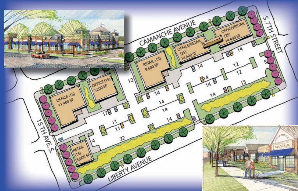
Representative Parcel Concept