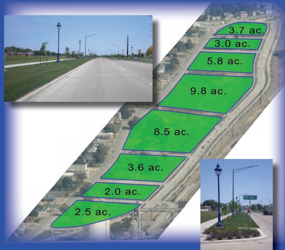
Parcel Areas (approximate acreages)